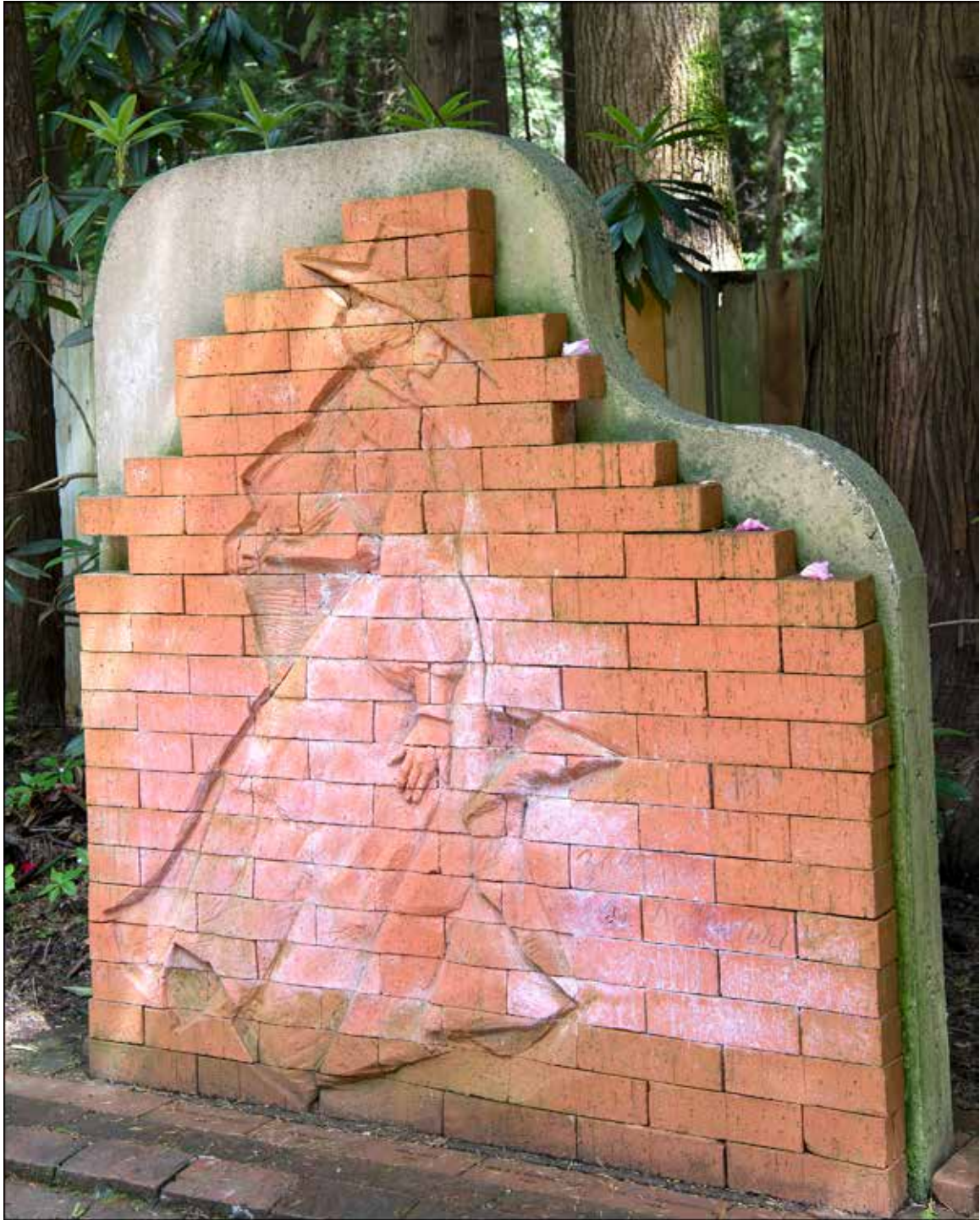
Zoe Garden Wall , Donna Dobberfuhl (Carved Brick)