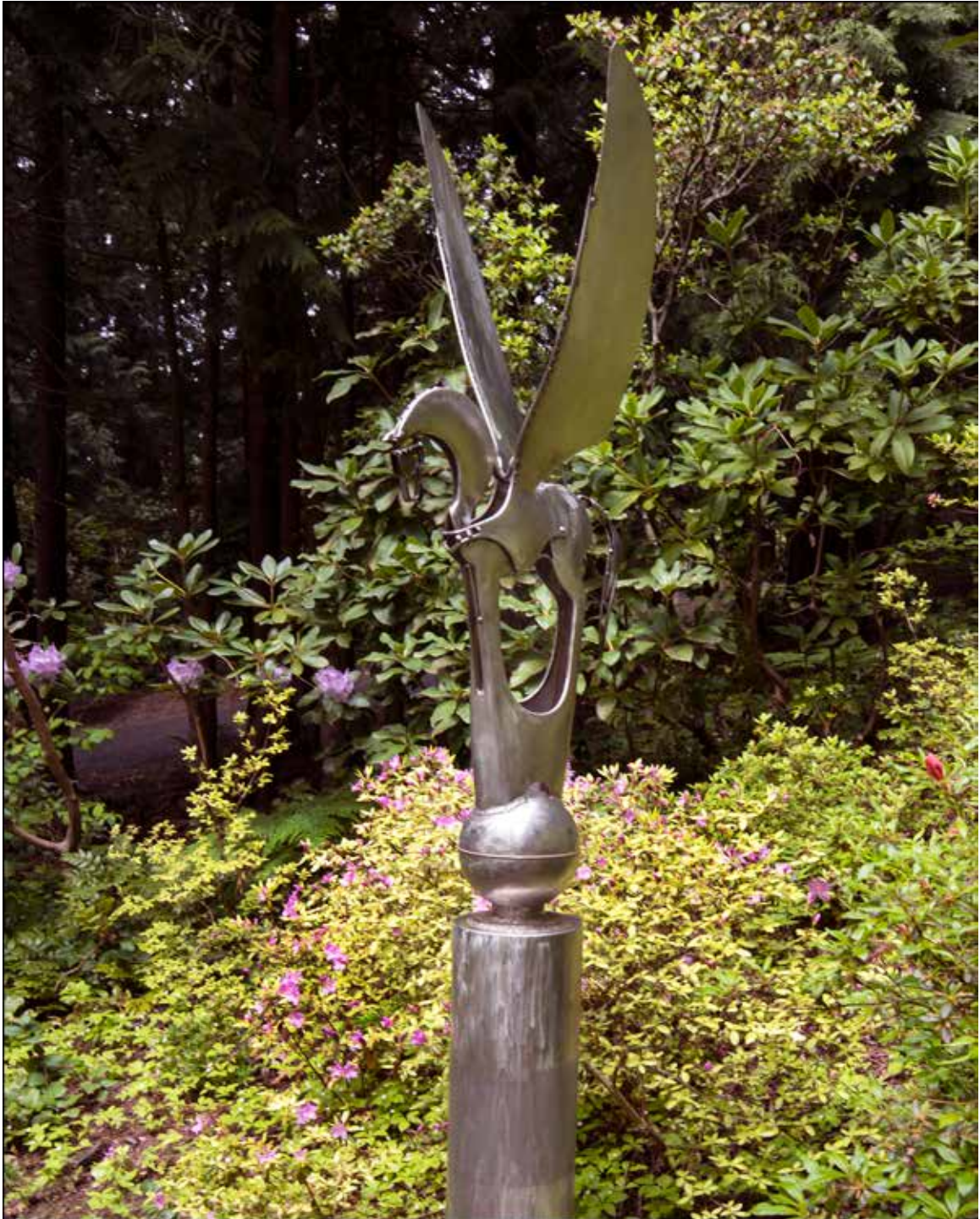
The Messenger , Devin Laurence Field (Stainless Steel)