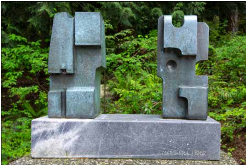
Sun Gate (Bronze on Marble base) 1982