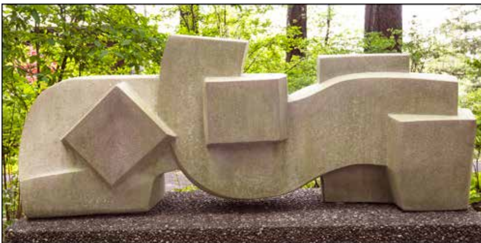
Animal (Sandstone) 1963