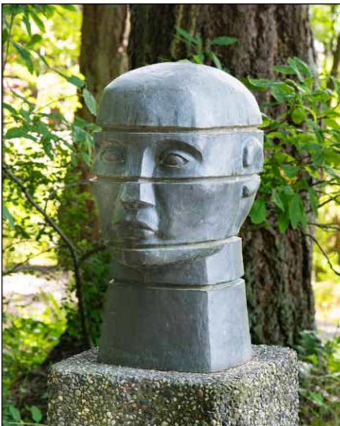
Large Head (Bronze)