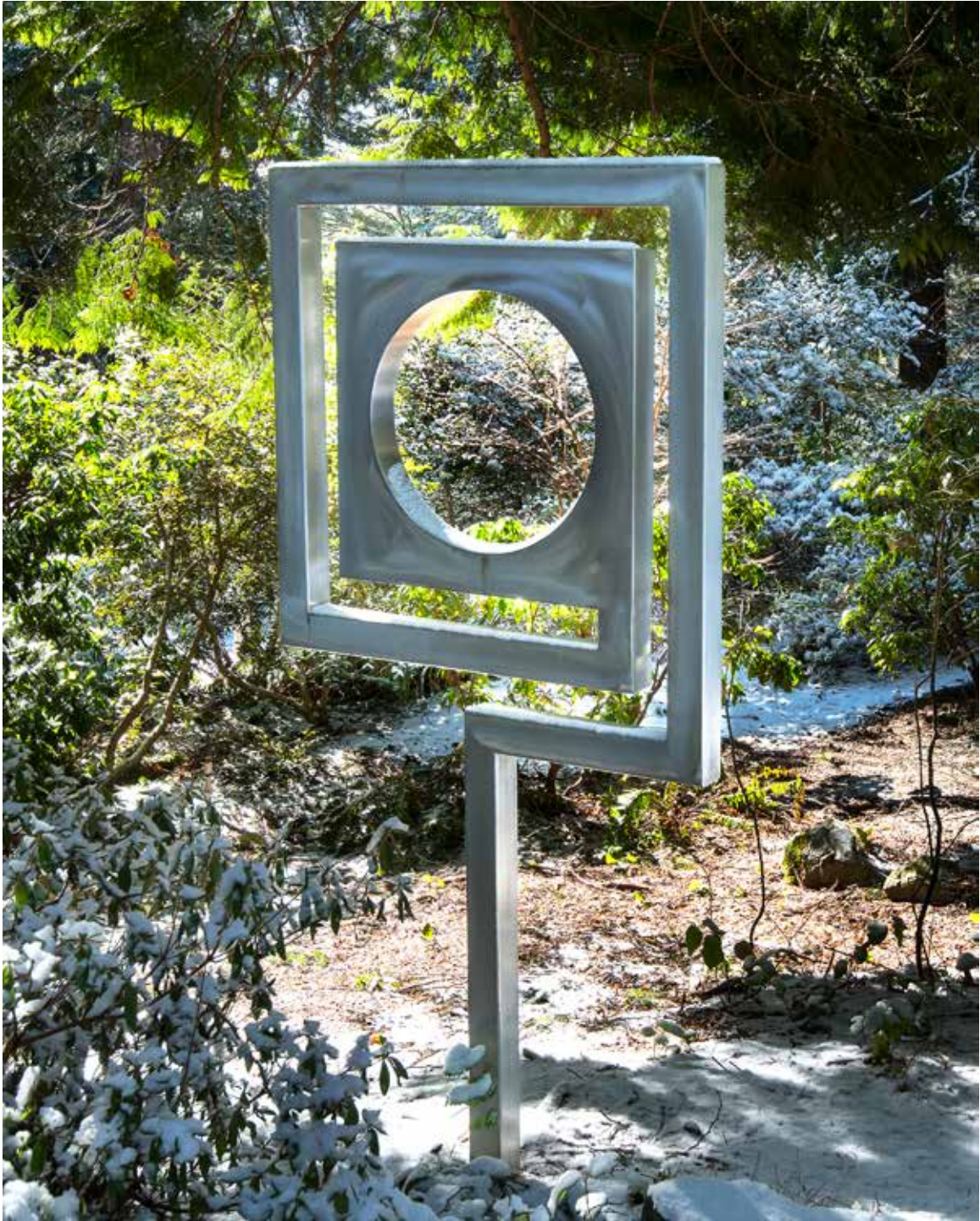
Untitled , Pat Kuehnel (Stainless Steel)