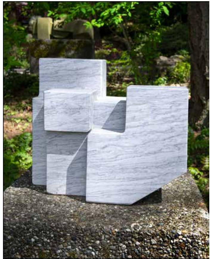
Four Forms (Marble)