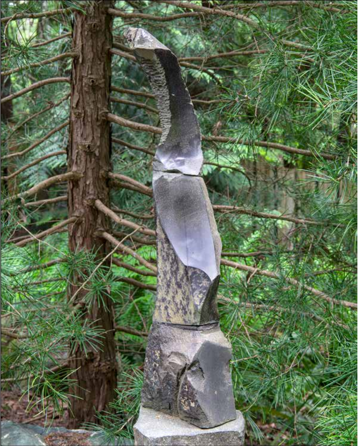
Cobra Dream , Elaine MacKay (Basalt)