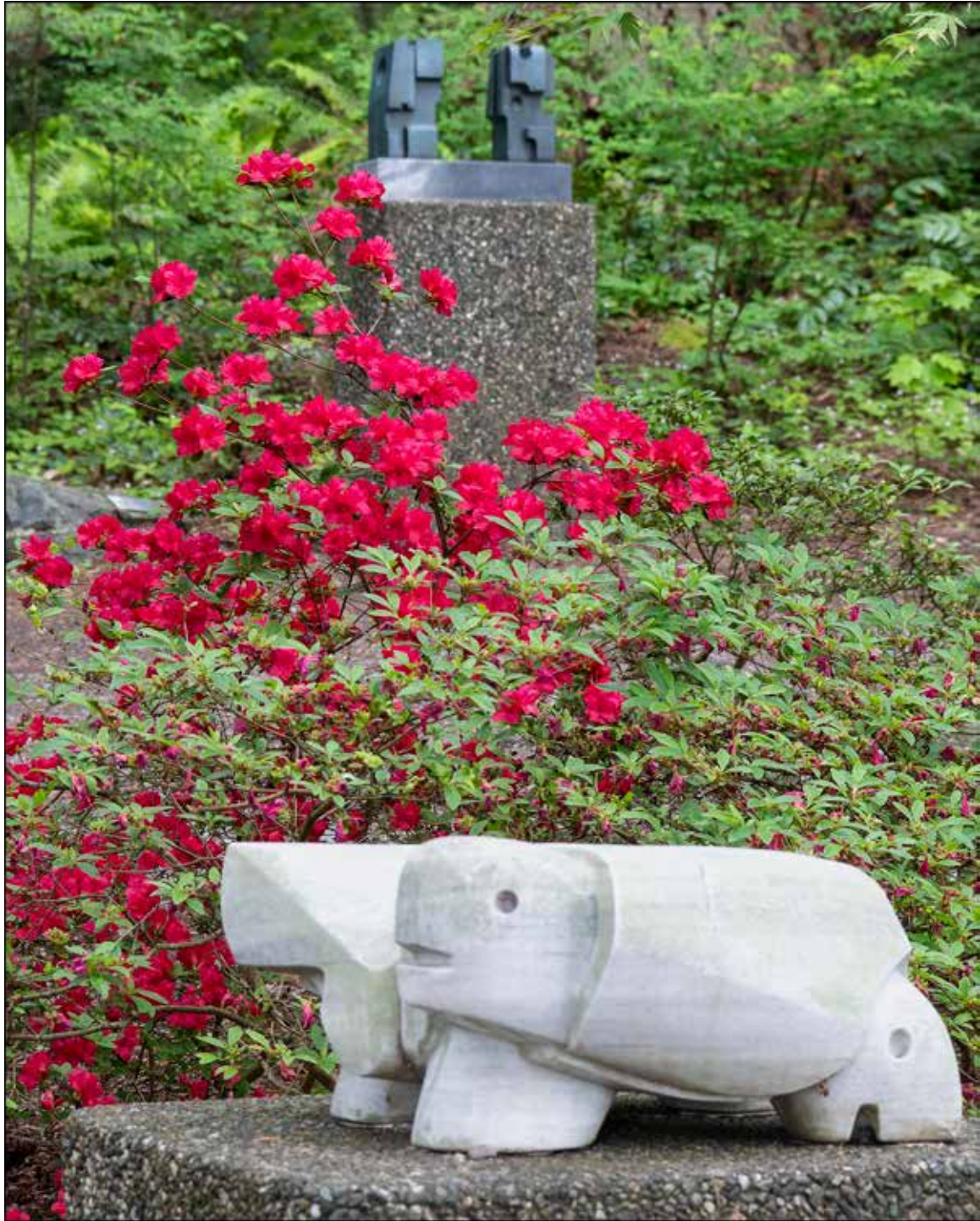
Turtle (Marble) and Sun Gate (Bronze) in their natural habitat among the Azaleas.