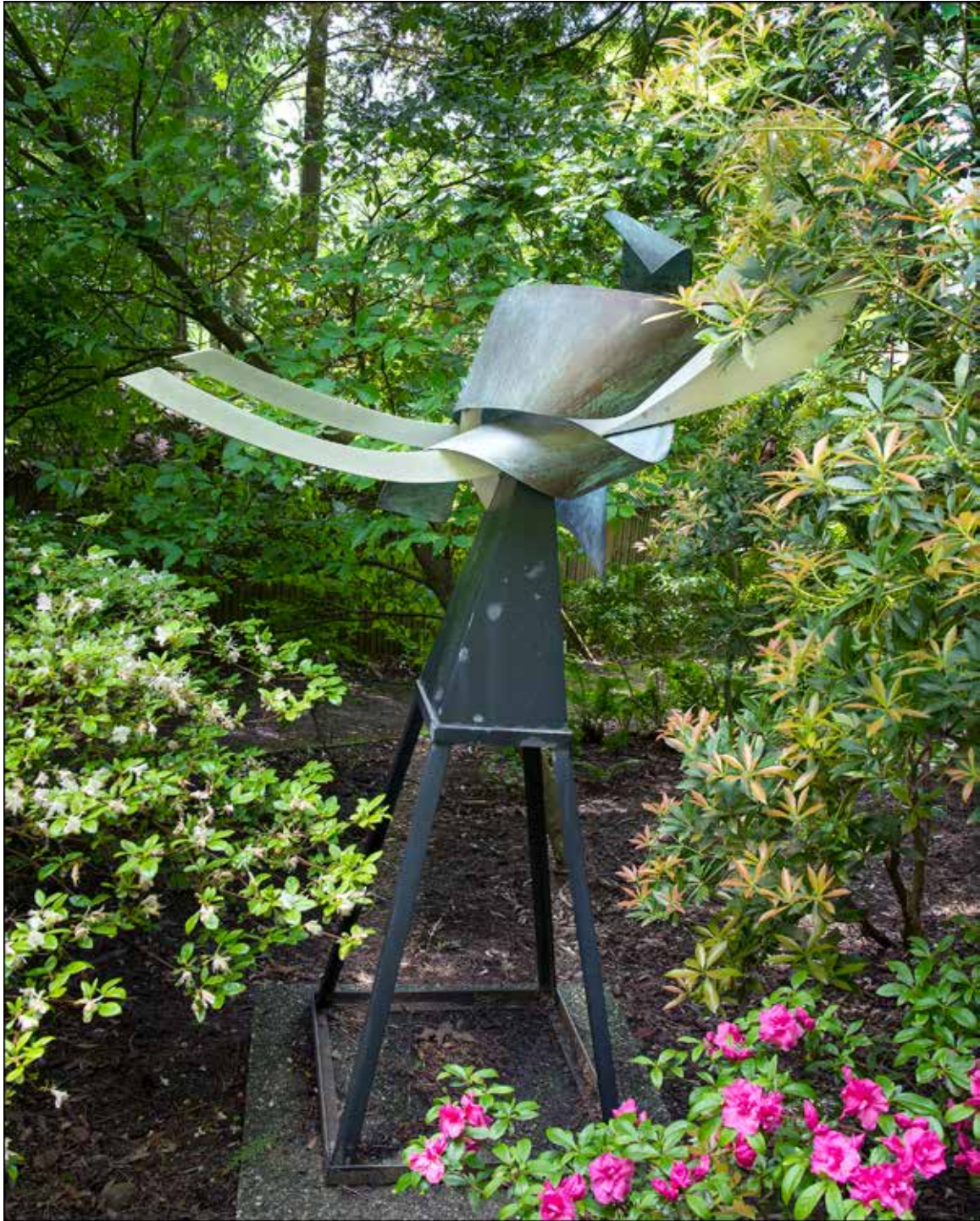
Volatus , Rodney Carroll (Steel & Polished Aluminum)