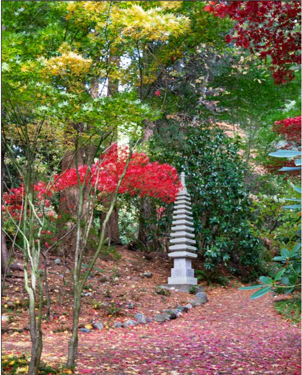
Granite Pagoda to Honor the 12 Local Men Who Died in the Korean War

The Bellingham Parks & Recreation Department manages the Big Rock Garden property and a volunteer organization, the Friends of the Big Rock Garden , is responsible for the art collection. This group depends on donations of time and money to preserve the sculptures and maintain the landscape in the Park.