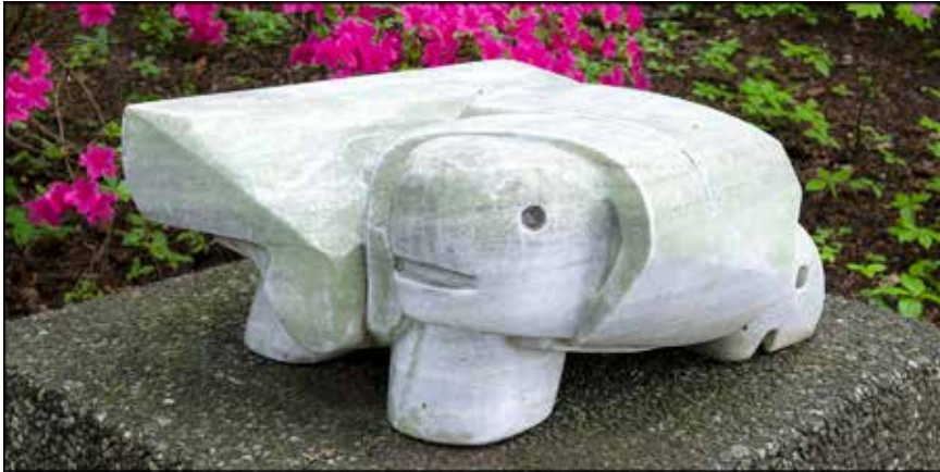
Turtle (Carrera Marble) 1974