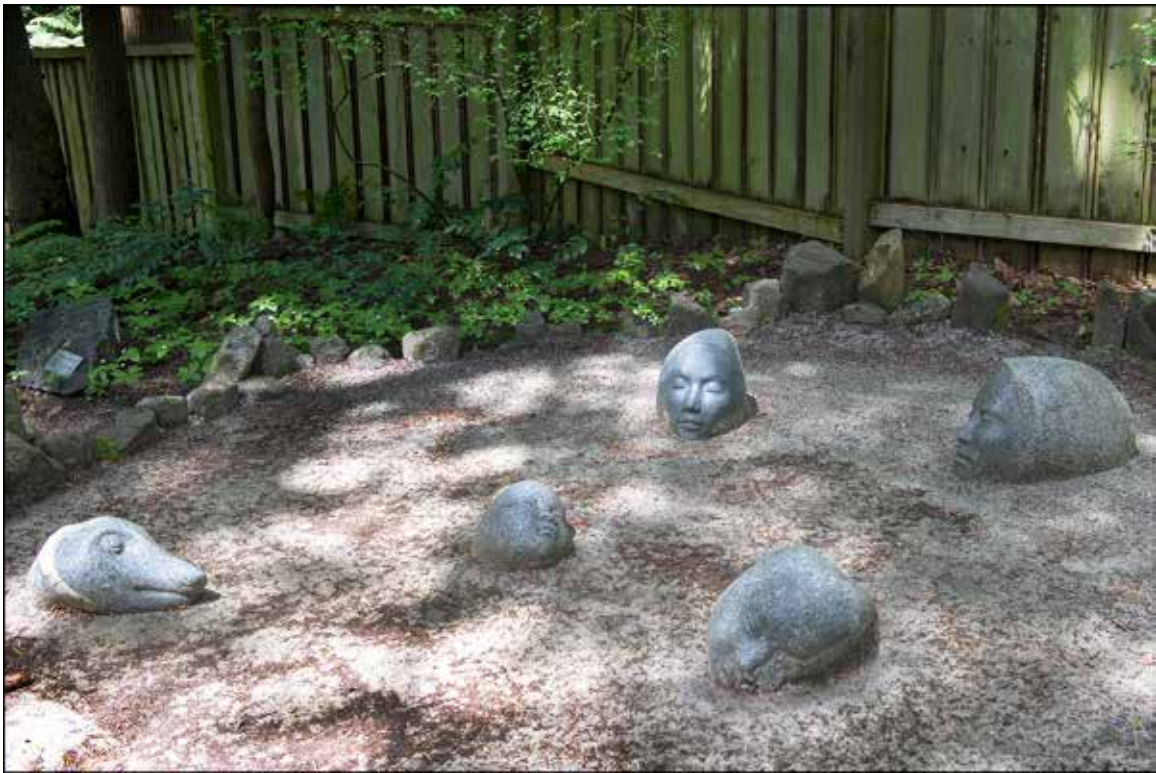
Endangered Species