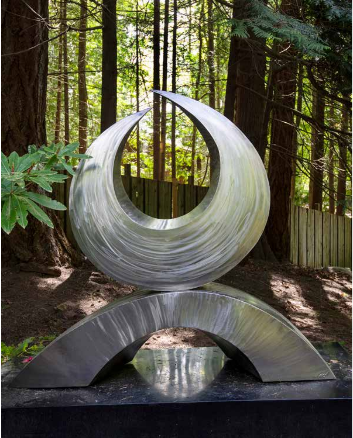
Spiral Fractal #2 , Don Anderson (Stainless Steel)