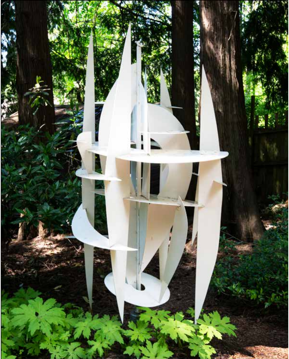
Stabile , Jan Za (Painted Steel)