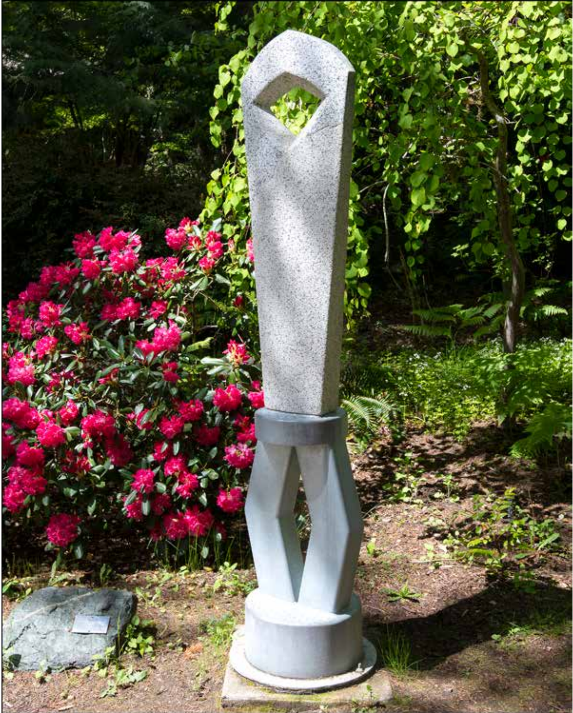
State Street Totem, Reg Akright (Granite Curb Stone)