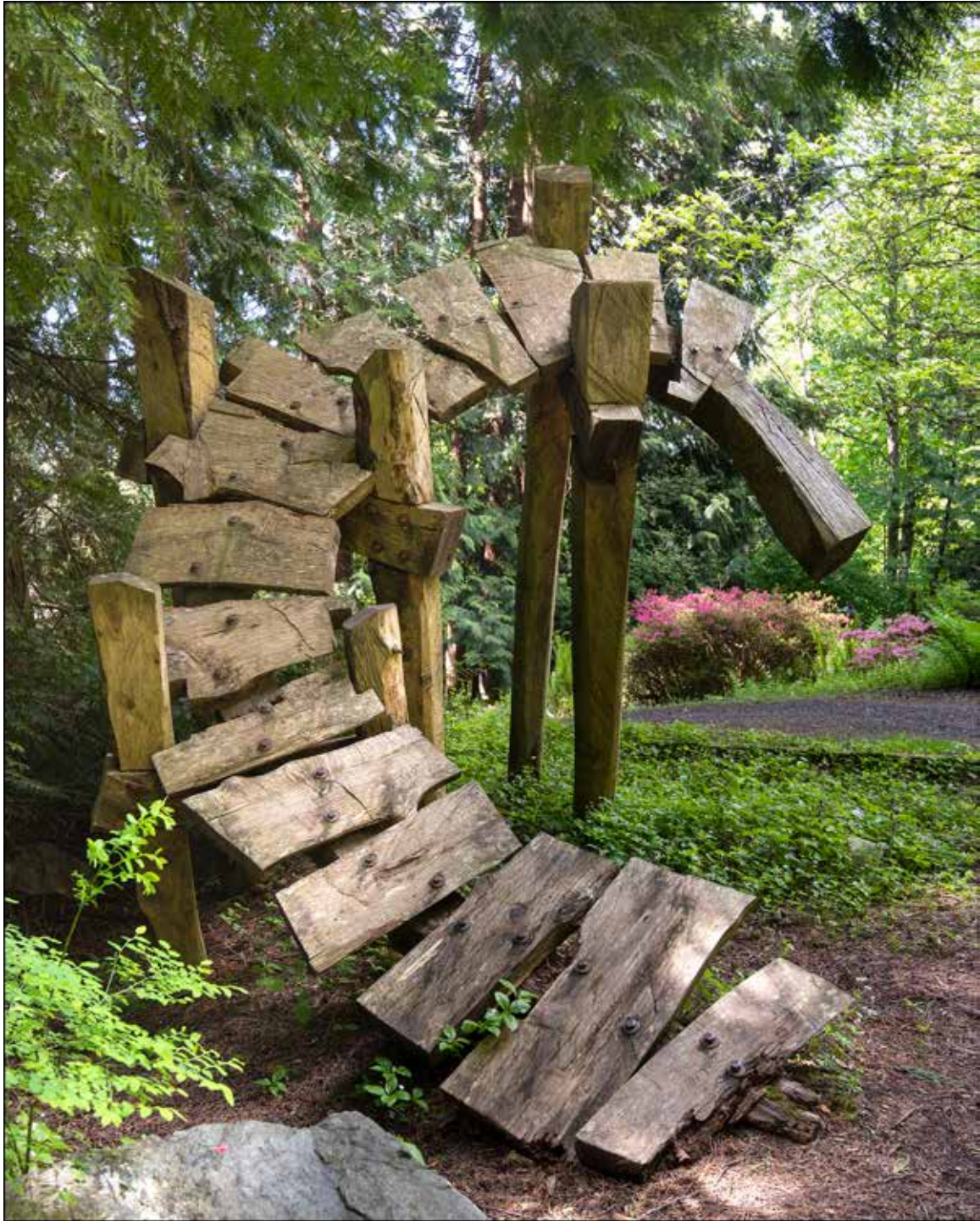
Turn , Lee Imonen (Cypress Pine & Copper)