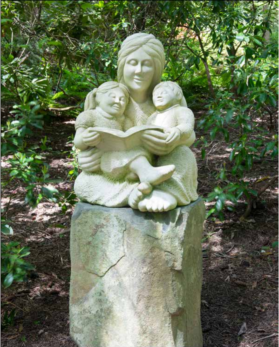
Peace , Tracy Powell (Limestone)