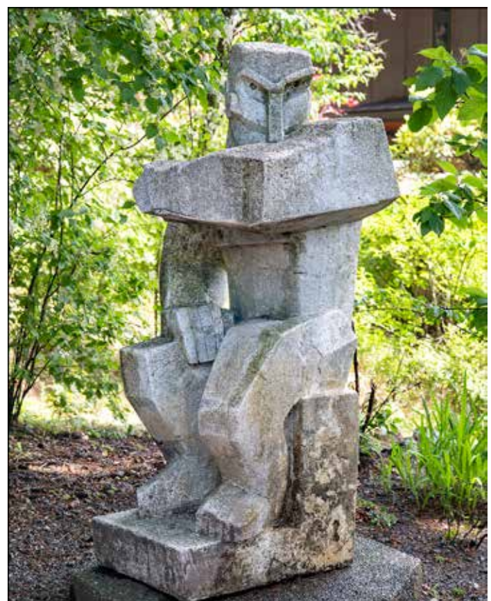
Man with a Broken Arm (Concrete)