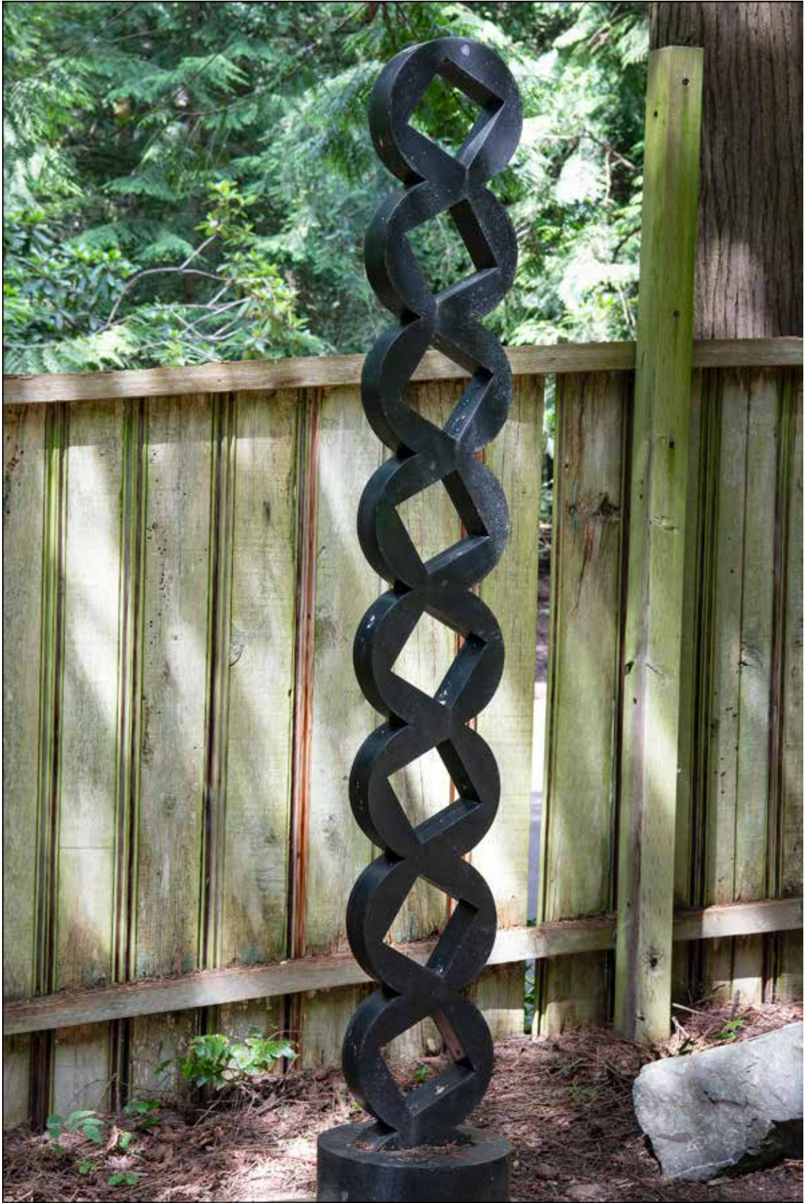
Form of Chain, Kenji Gomi (Resin & Stainless Steel)